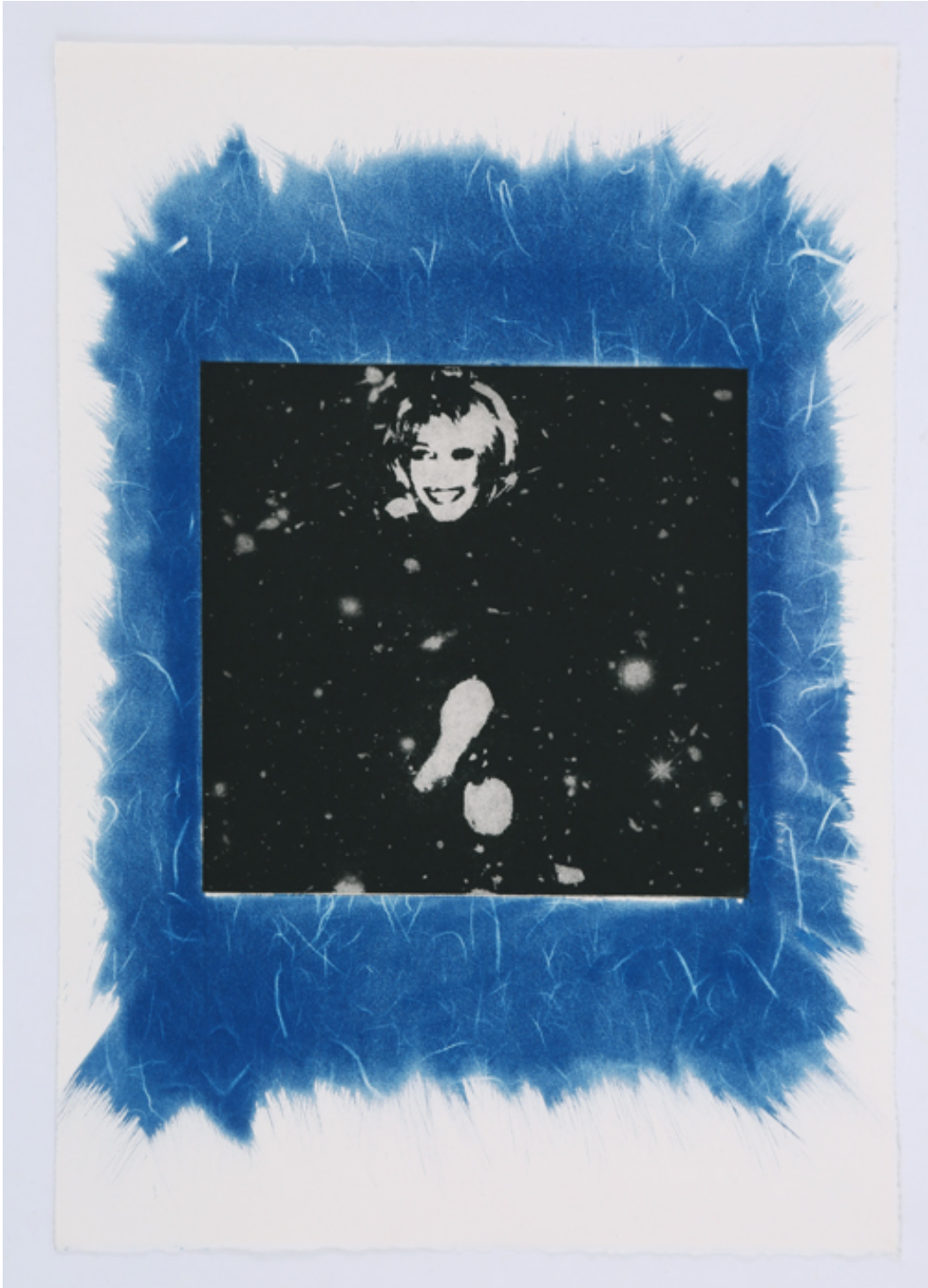
Memory Imprint (WH5)

Aquatint etching with cyanotype, 15" x 22" on Arches Cover White paper, 2019