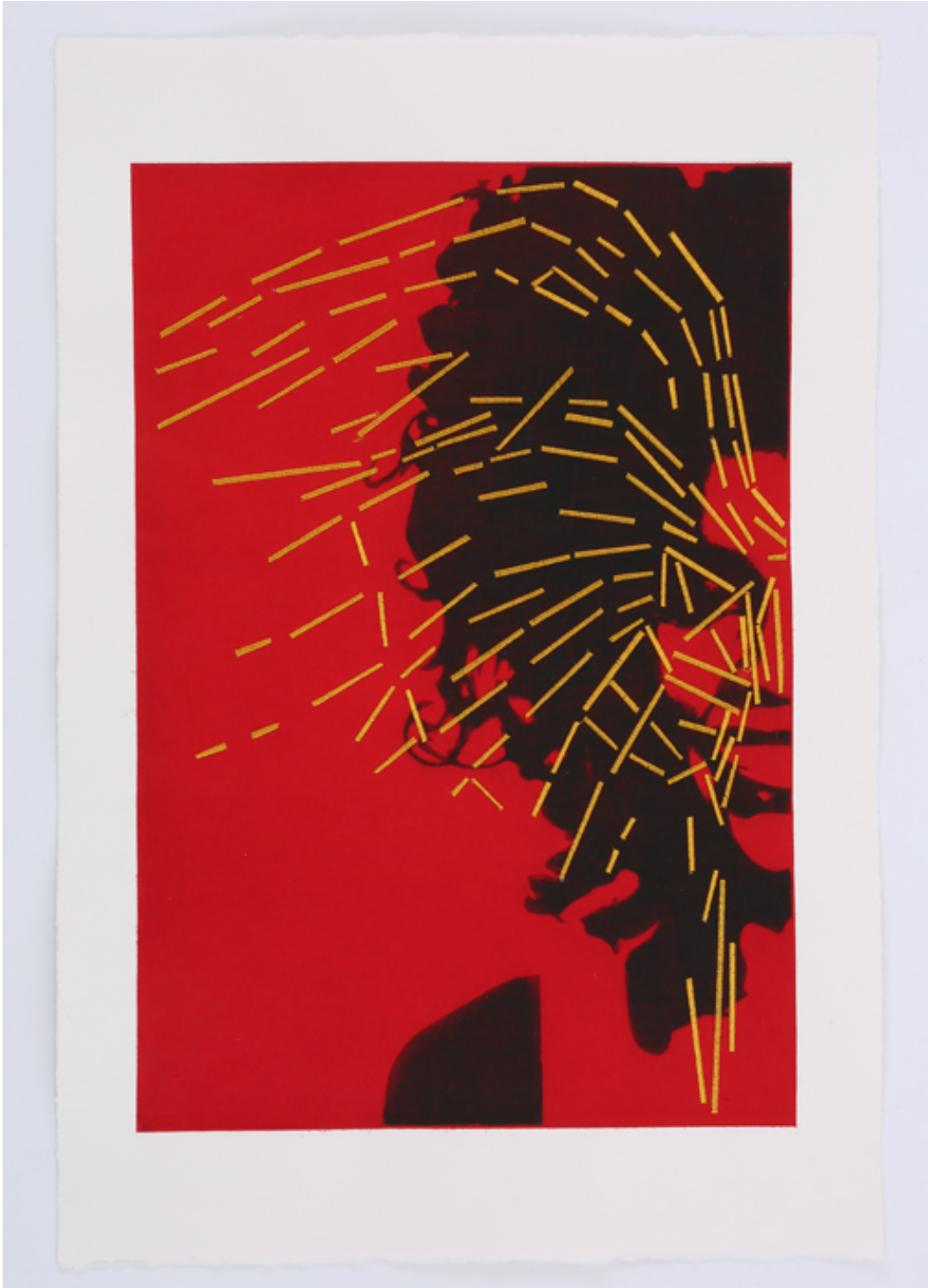
Memory Imprint (WH2)

Aquatint etching, chine-collé and embroidered thread, 15" x 22" on Arches Cover White paper, 2019