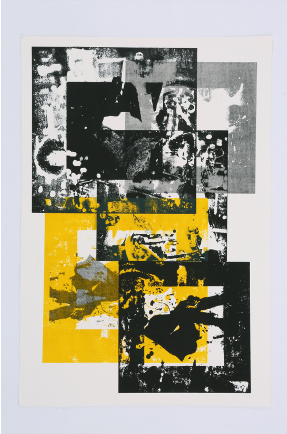
Memory Imprint (WH3) Photolithographs, 22" x 15" on Arches Cover White paper, 2019