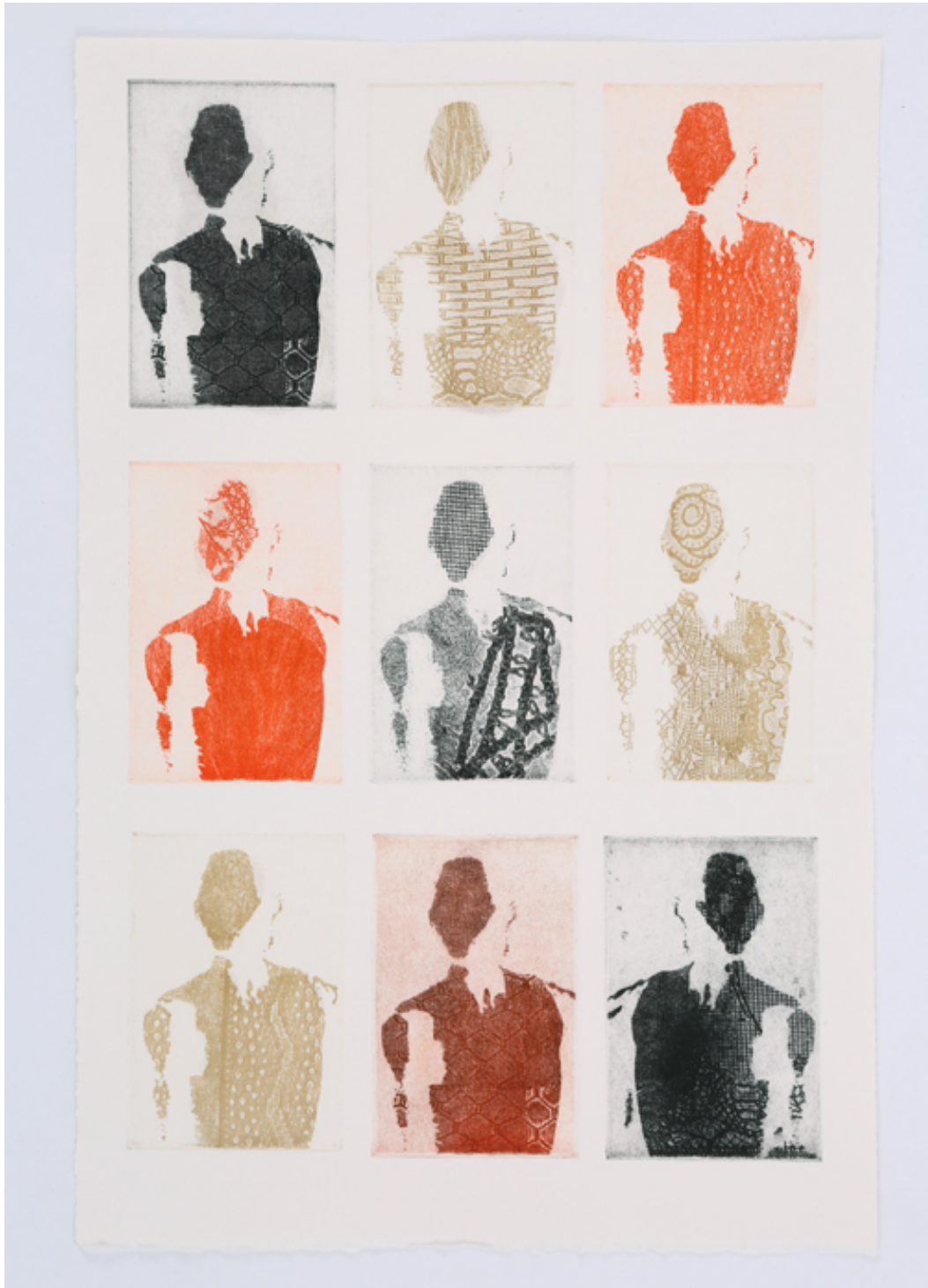
Memory Imprint (WH1)

Aquatint etching, 15" x 22" on Arches Cover White paper, 2019