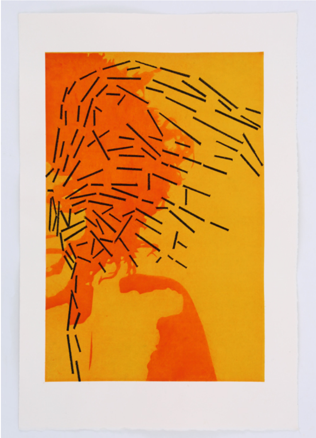
Memory Imprint (WH2)

Aquatint etching, chine-collé and embroidered thread, 15" x 22" on Arches Cover White paper, 2019