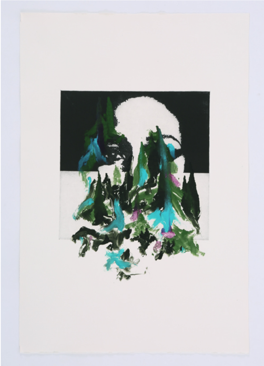
Memory Imprint (WH3)

Aquatint etching with oil stick monotype, 15" x 22" on Arches Cover White paper, 2019