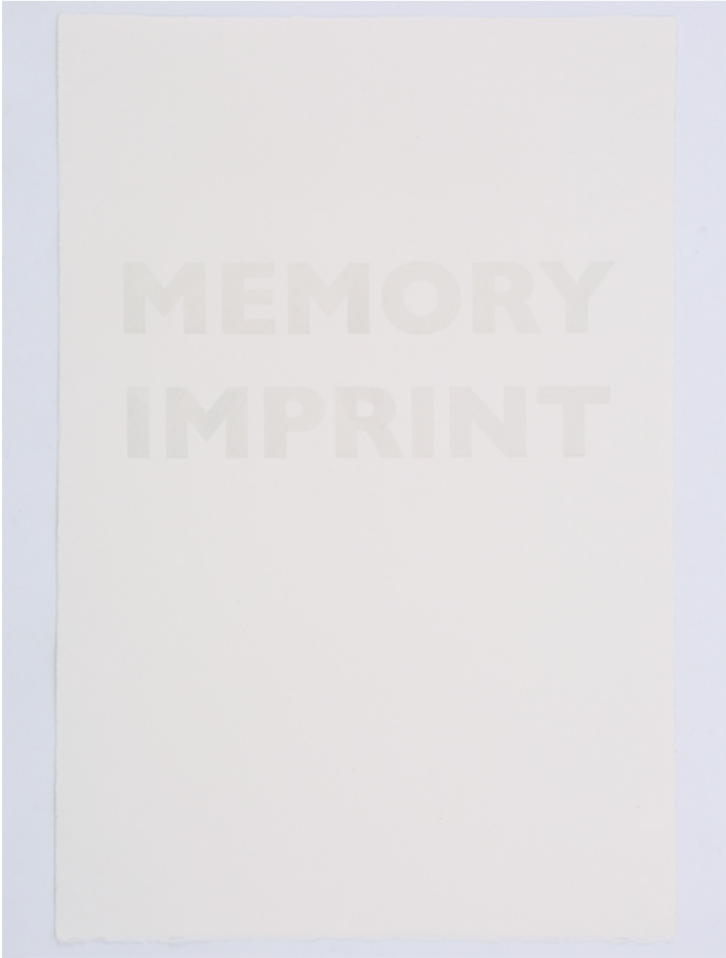
Memory Imprint , title page Letterpress, 15" x 22" on Arches Cover White paper, 2019