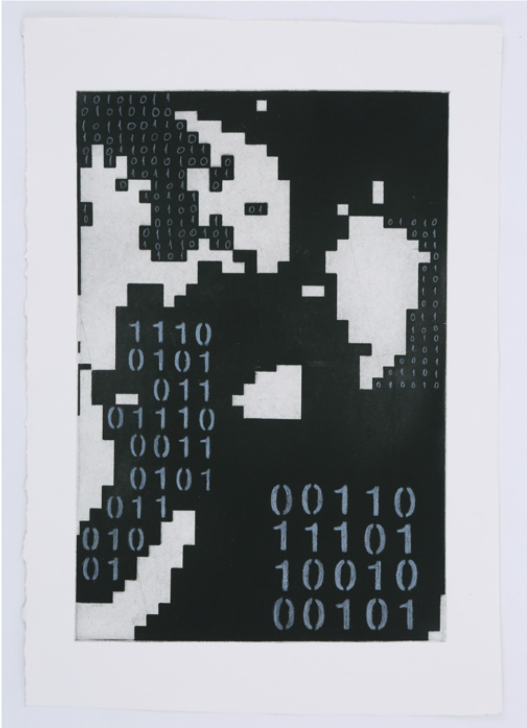
Memory Imprint (WH3)

Aquatint etching with white graphite, 15" x 22" on Arches Cover White paper, 2019