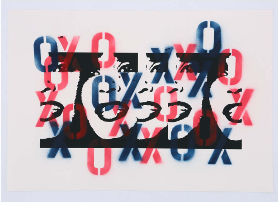
Memory Imprint (WH4) Silkscreen with acrylic stencil, 22" x 15" on Arches Cover White paper, 2019